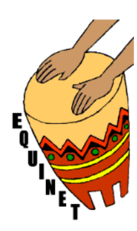
2.6 ISSUES ARISING

vii.the extent to which these issues feature in health and wider policy agendas and the factors influencing their incorporation into policy.