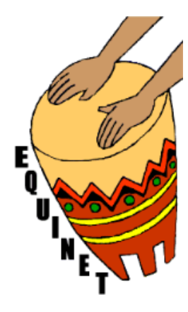
2.6 ISSUES ARISING

also allow for regional dimensions of these issues to be explored. Regional exchange of information and learning on equity in health and health care would promote consensus on the critical dimensions of equity in the SADC region and promote policies that address equity within and across the region.