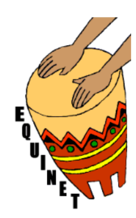
2.2 HEALTH RIGHTS AND POLICIES: WHERE DOES EQUITY FEATURE?

constitutional rights may be a necessary but not sufficient mechanism for the practical expression of the right to health, and the more specific expression of the general right to health in subsidiary law and the systems and procedures by which social groups claim legal rights are equally important.