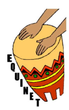
2.2 HEALTH RIGHTS AND POLICIES: WHERE DOES EQUITY FEATURE?