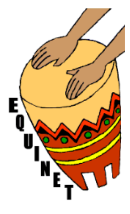
3.1 CONCEPTUALISING EQUITY IN HEALTH

to access. Differences in utilisation rates of certain services between different social groups, does not automatically imply inequity as there is need to ascertain why the rates are different. Where use of services is restricted by social or economic disadvantage, there is a case for aiming for equal utilisation rates for equal need. Equal quality of care, implies equal opportunity of being selected for attention through a fair procedure based on need rather than social influence. Equity does not therefore mean that everyone should have the same health status or consume the same amount of health service resources irrespective of need. Accepting equity as a goal is a stimulus to recognise and challenge the causes of inequities involving a range of levels and sectors of activity.