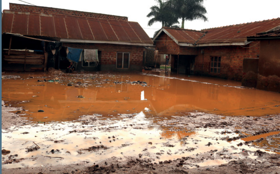
A flooded compound in the St. Francis zone with water containing solid waste entering the houses.

Innovations for Development got involved in the briquette-making intervention during the documentation of the promising practices promoting urban health in Kampala (Gotto and Mhlanga, 2022).