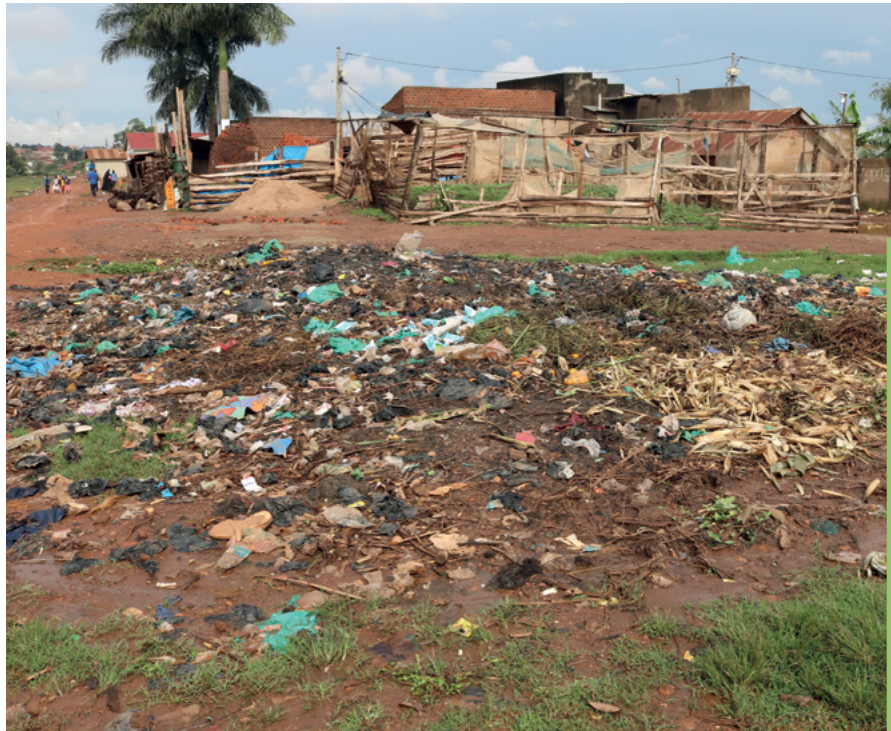
An open site where residents of St Francis zone dump their waste

The inadequate management of solid waste in Bwaise presents numerous difficulties, including sporadic flooding and outbreaks of diseases. Recognizing the need to address these challenges and the economic struggles faced by the community, the local chairpersons took the initiative to motivate the residents. They initiated training programs, facilitated through saving groups, to educate the community on utilizing waste as a valuable resource for creating household items such as briquettes. The concept of producing briquettes was inspired by neighbouring communities like Kalerwe and Rubaga Division.