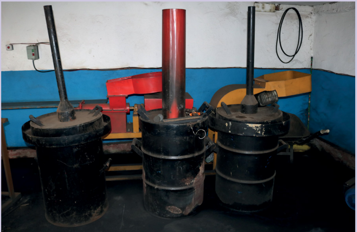
Carbonising machines used to turn solid waste into char

Citation: Gramsen Kizza F, I4DEV (2023) Solid waste management in Slum Communities of Bwaise III Parish: Transforming Solid Waste into Valuable Resources, EQUINET, I4Dev, Uganda