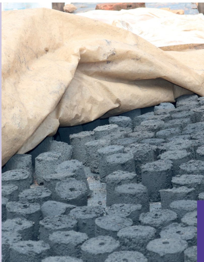
Members of the Kyosimba Onanya saving group demonstrating how to make briquettes (Left) Ready-made briquettes left to dry on a rack (right)