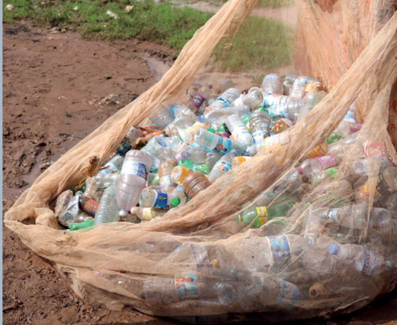
Boxes of packaged briquettes by the FOLDL youth group that are ready for the market (Left) A plastic waste collection Nest in the Katoogo zone (Right)