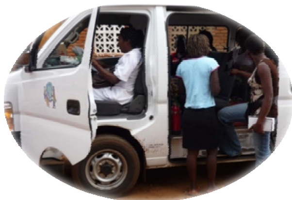
Figure 5: Sex workers coming to for testing and treatment

In the door-to-door campaign, the team provided counseling to CSWs, encouraging early reporting to services for illness. As a result of observing some problems with the health of CSW children, groceries like soap, iodized salt and sugar among others were also distributed to support some additional health promotion on hygiene and oral rehydration for children, while noting that this demands follow up intervention by the team.