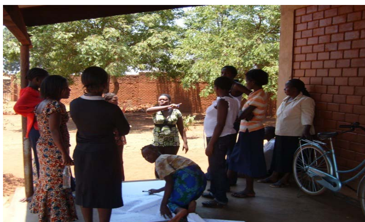
Figure 4: CSWs discussing barriers they face

A number of reports and allegations were made of disturbing and harsh treatment, sexual harassment and ill treatment, that are recorded here and that the study was not in a position to verify.