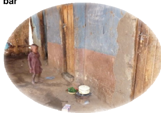
Figure 6: CSW rooms and children at a local bar

Health-workers and CSWs from Girls Alliance towards Behavioral Change (GABC) jointly worked together to reach out to other commercial sex-workers. GABC was responsible for booking appointments with CSWs. CSWs were visited either at home or at brothels. For brothel visits, GABC got consent and booked appointment with bar owners. We learned during the study that some bar proprietors are alleged to provide CSWs with accommodation for which CSWs pay only utility bills. The CSWs in their turn attract male customers to drink at the place. The CSWs had an identified leader, and the CSW leader and proprietor boss were visited with information with their consent, and these leaders informed the rest of the CSWs at that particular bar on the objectives of the intervention and the planned visit by the PRA team to discuss health with them. The approach was commended by the bar owners, who indicated that they were moved by the concept. An agreement with the bar owners and the CSWs was reached and a date for the talks was set.