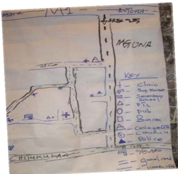
Figure 2: Social map drawn by participants