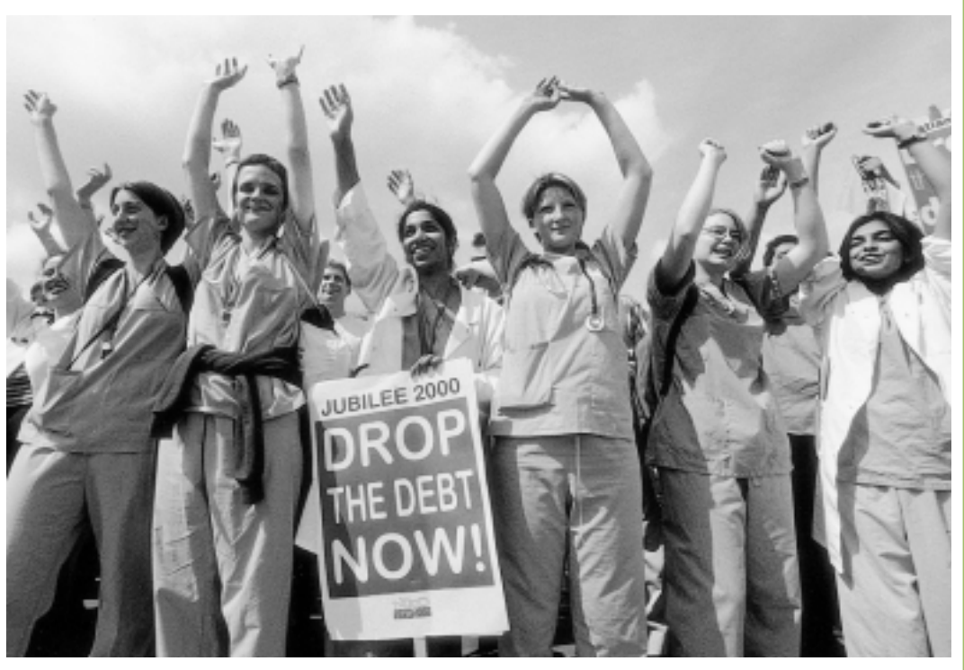
Medical students demand debt cancellation

Jubilee 2000 showed that a broad coalition – which included prominent groups of health professionals – can increase popular understanding of global problems, apply pressure and bring about change.