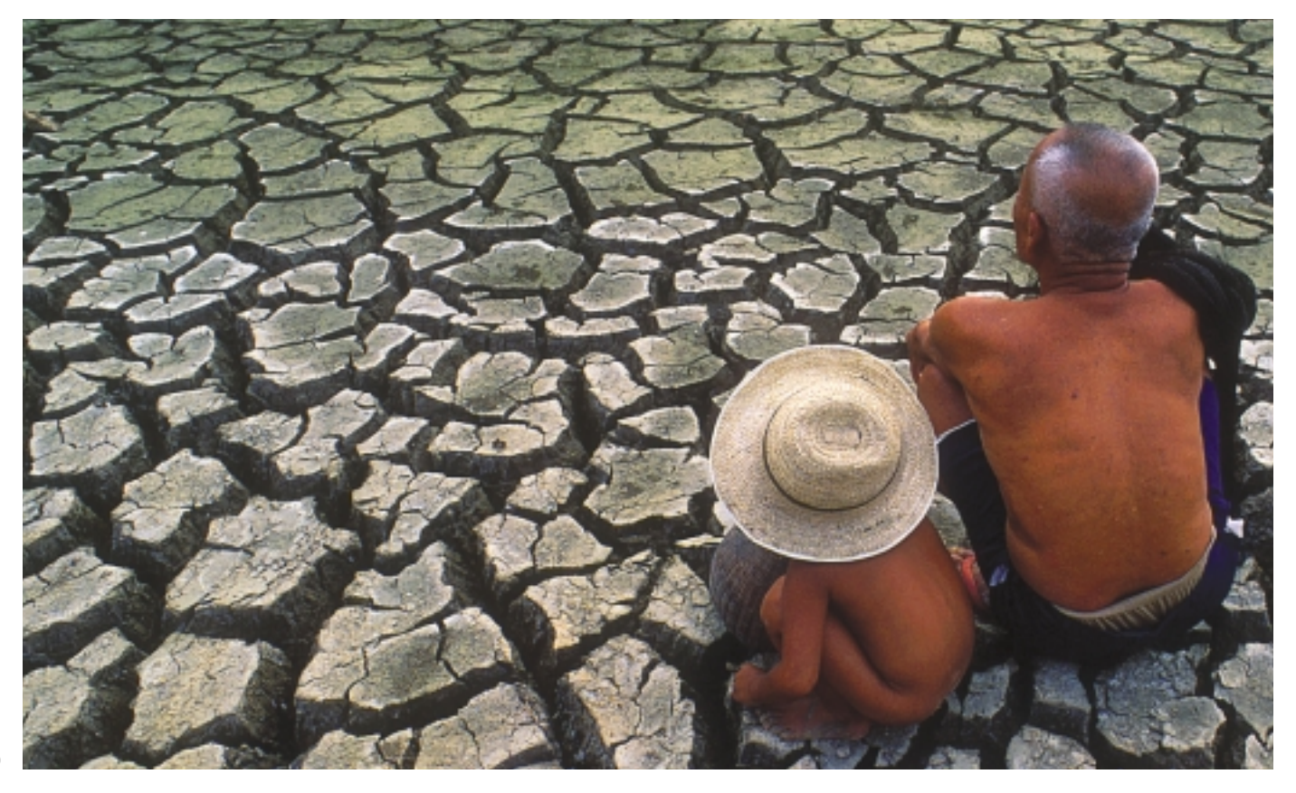
Droughts threaten the food security of millions in the developing world

Citizens around the world are waking up to the ecological crisis. But action by concerned individuals will not be enough. In the long term, a complete rethink of the way we live is needed.