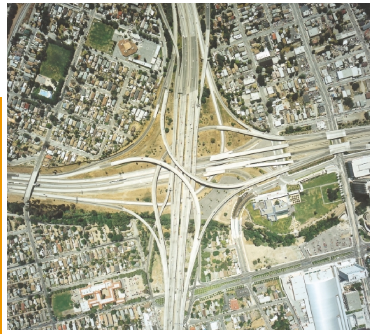
Transport and travel are major drivers of climate change