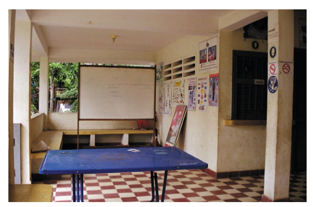
Figure 1: Empty health facility in Cambodia

immunisation coverage in sub-Saharan Africa is estimated to have dropped from an average of 62% in 1990 to 50% in 1999. Other key coverage indicators, such as the proportion of women who were attended by a trained health-care worker during delivery, have stagnated. Understanding the reasons for our inability to increase coverage, especially among the poorest people, is a first step towards recouping what we have lost and moving towards universal coverage.