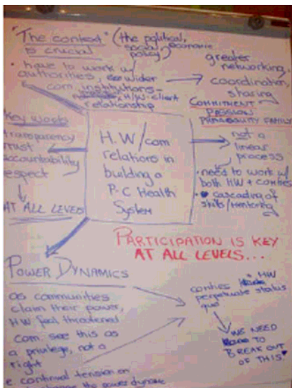
Discussion chart on Health Worker - Community interactions: 22 September 2009

The work on health worker-community interaction showed that communication needs to also bring in influential powers in the district councils/local government, including managers and frontline primary care workers in communities, as this improves communication skills and validates community knowledge. This is critical as differences in culture and power relationships between health workers and their clients can act as barriers to effective and sustainable health development. The health workers involved in the PRA processes became more open to listening to community members, and to communicating information to communities demystifying perceptions. The processes enhanced team working, participatory decision-making and use of local ideas for solving health problems collectively.