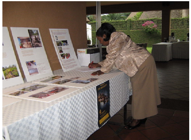
Feedback on the work at the exhibit D Baatjies 09

The photographers felt the exhibit to have been a success. It communicated many of the realities that we experience in our communities and the work that we are doing. However, they grappled with finding the right captions and quotes to convey the full extent of what they were trying to capture with the image. Selemani Ally Joe, in Bagamoyo, Tanzania, resorted to mini films to capture the full extent of the environment of a specific place, or the nature of a conversation between people. Finding ways of conveying a fuller picture, through quotes, caption, or even picture codes alongside photographs, is something that needs further work in the future.